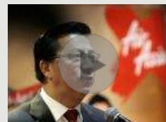
Liow: Get the facts right